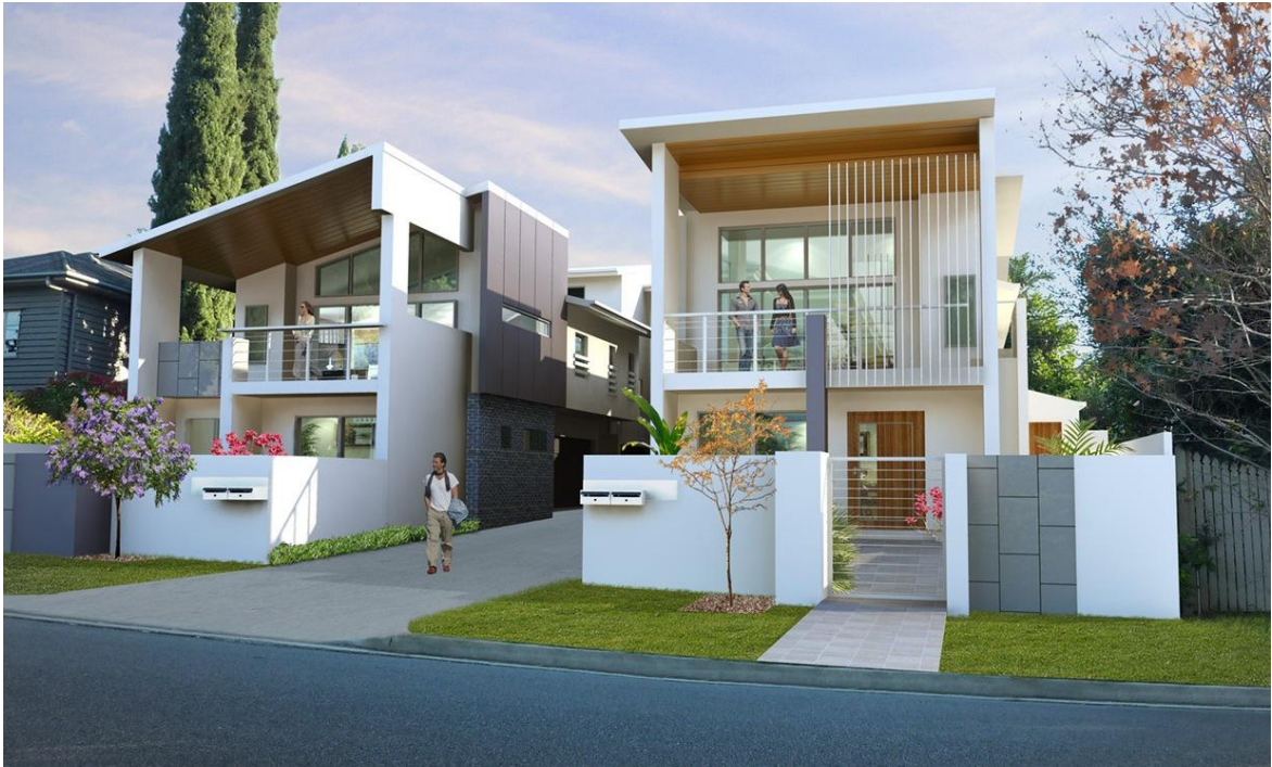
Artists Impression Only

12, 12A, 14 & 14A Newcross Street, Indooroopilly