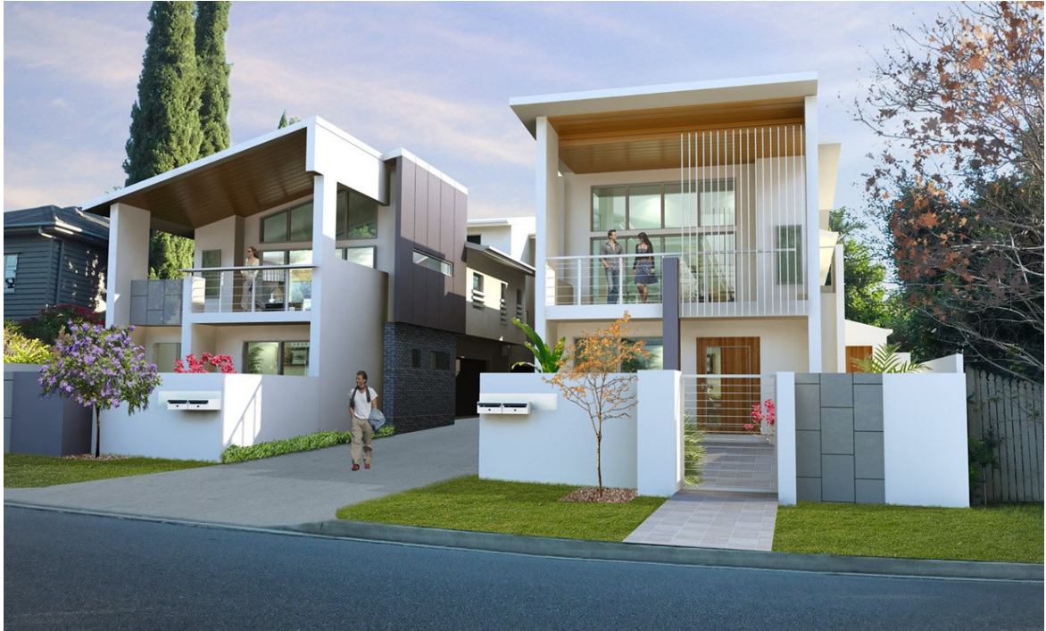
Artists Impression Only

12, 12A, 14 & 14A Newcross Street, Indooroopilly